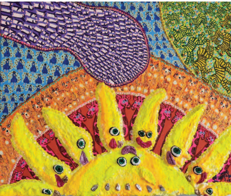
Maija Peeples-Bright, Beast Sunburst enthAREs the Sky , 2025.

January 17–April 26, 2026 Opening Reception: January 24, 2026